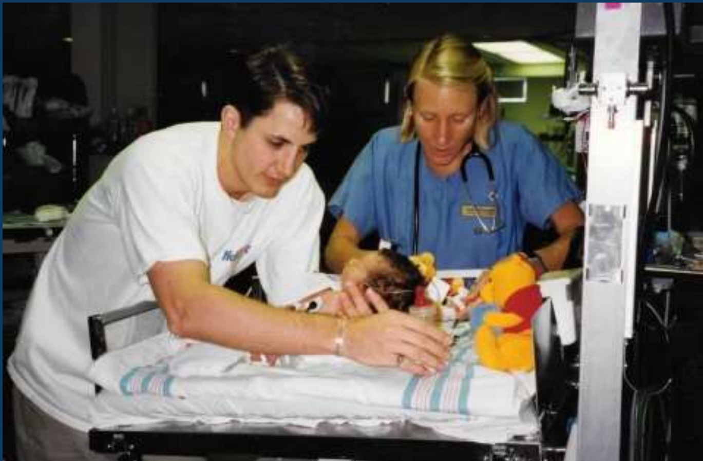
June 1996, post-op BTT Shunt