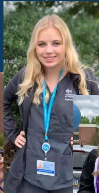
First day at CHOP!