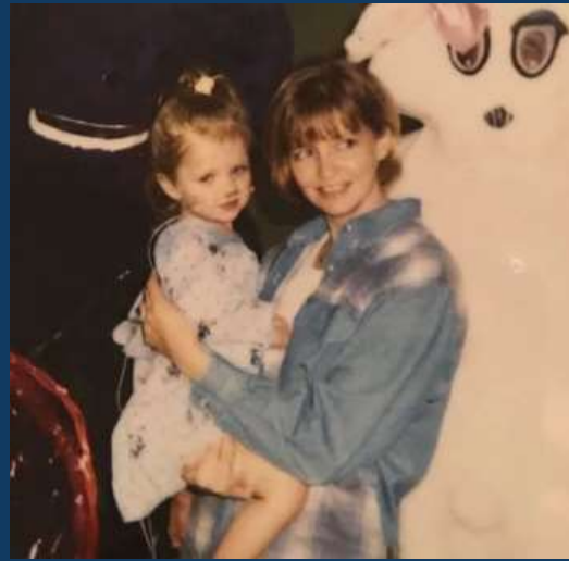
April 1998, post-op Fontan Completion

“more moments of my life began to highlight how different I was from my peers.”