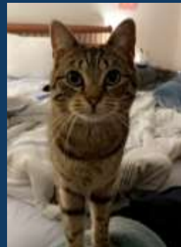
Sweet Pea the cat