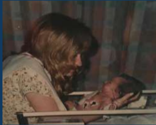
June 1996, post-op BTT Shunt