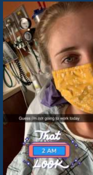
2020, Emergency Room