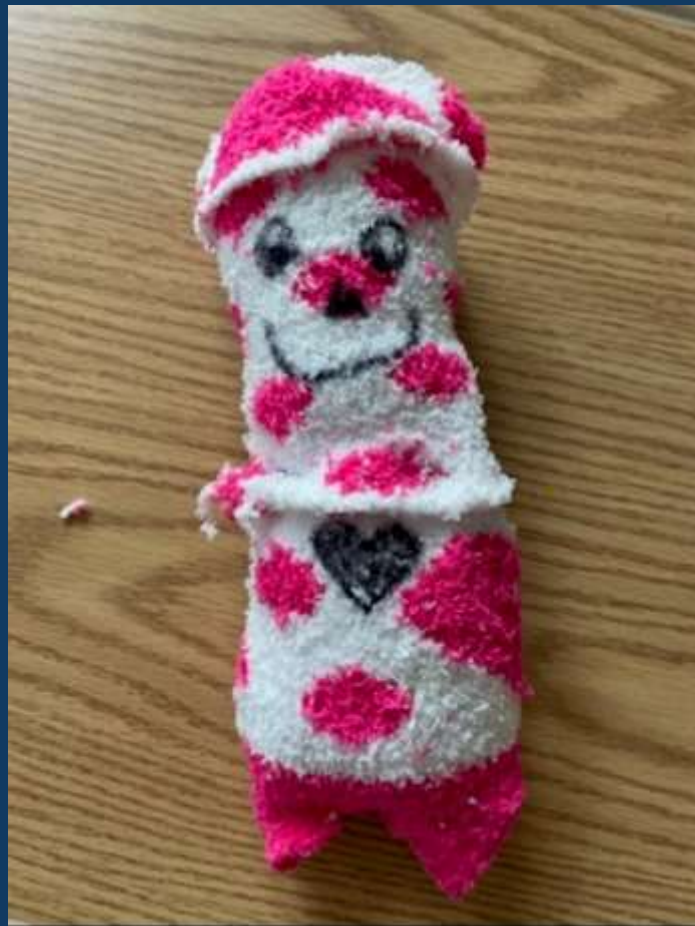
Sweet Pea the sock puppet