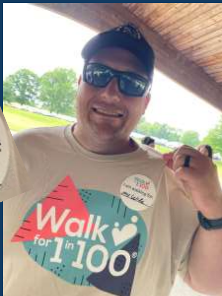
2023 Walk for 1 in 100