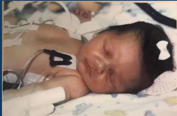
June 1996, pre-op